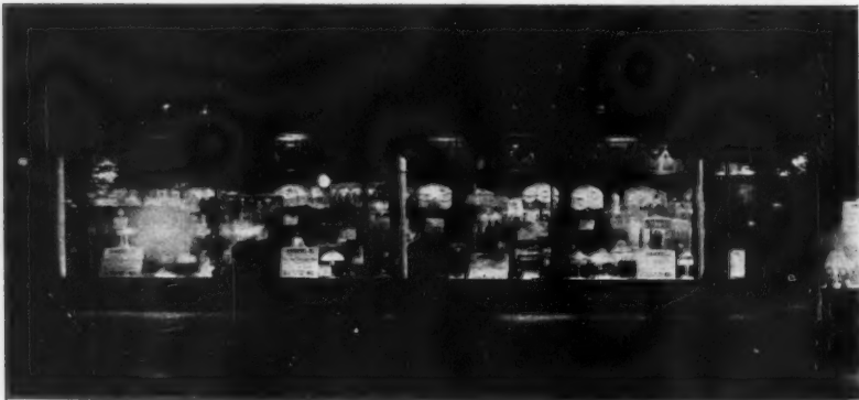
SANDERS' CHRISTMAS STORE

¶ The cornerstone of an orphan's home has been laid in St. Louis. Among the chief